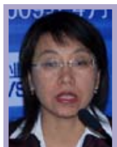
Liu Changchun Deputy Director General Department of Fiscal and financial Affairs, Legislative Affairs Office the State Council